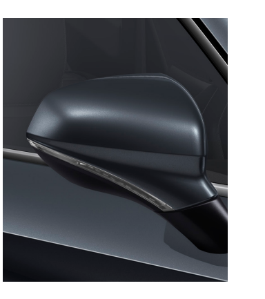
MAGNETIC TECH SE SE+ FR S7S7 - Metallic