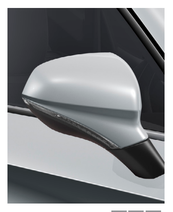
GLACIAL WHITE SE SE FR 2Y2Y - Metallic