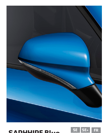
SAPHHIRE Blue N1N1 - Metallic