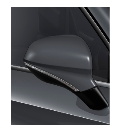
Graphene Grey R6R6 - Special