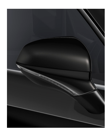
MIDNIGHT BLACK SE SE FR OEOE - Metallic