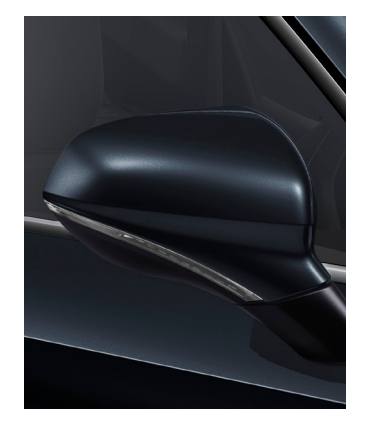
FIORD Blue 9K9K - Soft